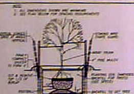
DETAIL - DECIDUOUS TREE PLANTING DETAIL

CALL 3 WORKING DAYS BEFORE YOU DIG 800 - 888 - 8888 - 8888 (204) 252-4444 ALWAYS - THE CALL CENTER