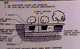
DETAIL - SHRUB PLANTING DETAIL